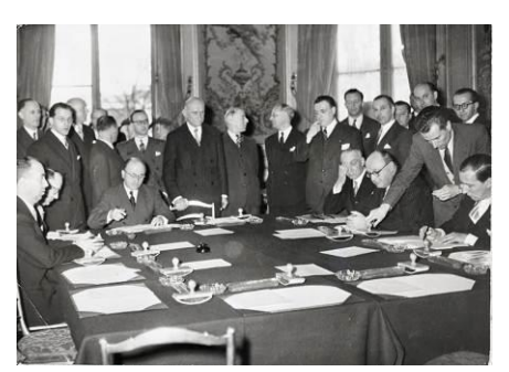
The Treaty on the European Coal and Steel Community was signed in Paris in 1951.

To secure peace, six countries – Belgium, France, Germany, Italy, Luxembourg and the Netherlands – decided to work together. They set up the European Coal and Steel Community to jointly control things needed to prepare for war: steel for weapons and coal for factories. This way, the countries could not secretly arm themselves against each other.