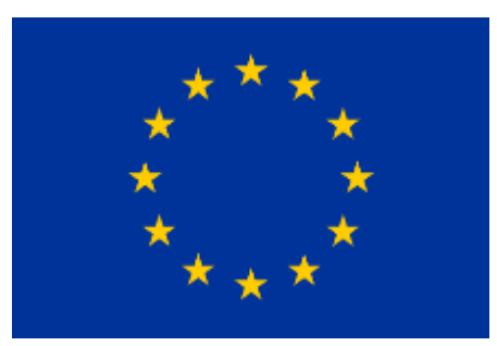
The European flag was adopted by the European Economic Community in 1985.

The six countries got on so well that they decided to go a step further and to set up the European Economic Community (EEC). 'Economic' means to do with money, business, jobs and trade.