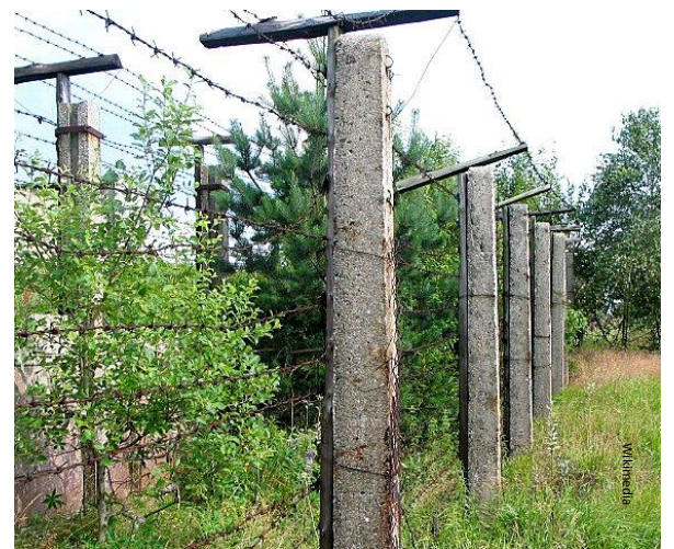
Remains of the Iron Curtain in former Czechoslovakia

The countries that had gained freedom reformed their laws and economies and joined the EU. The EU now has 28 member countries (see page 6).