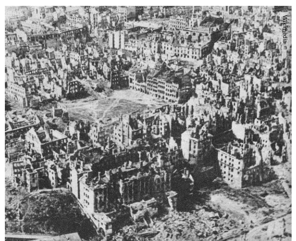
Almost all buildings in Warsaw were destroyed by the end of the Second World War.

In the 20<sup>th</sup> century, two wars that started on this continent spread and involved countries all around the world.