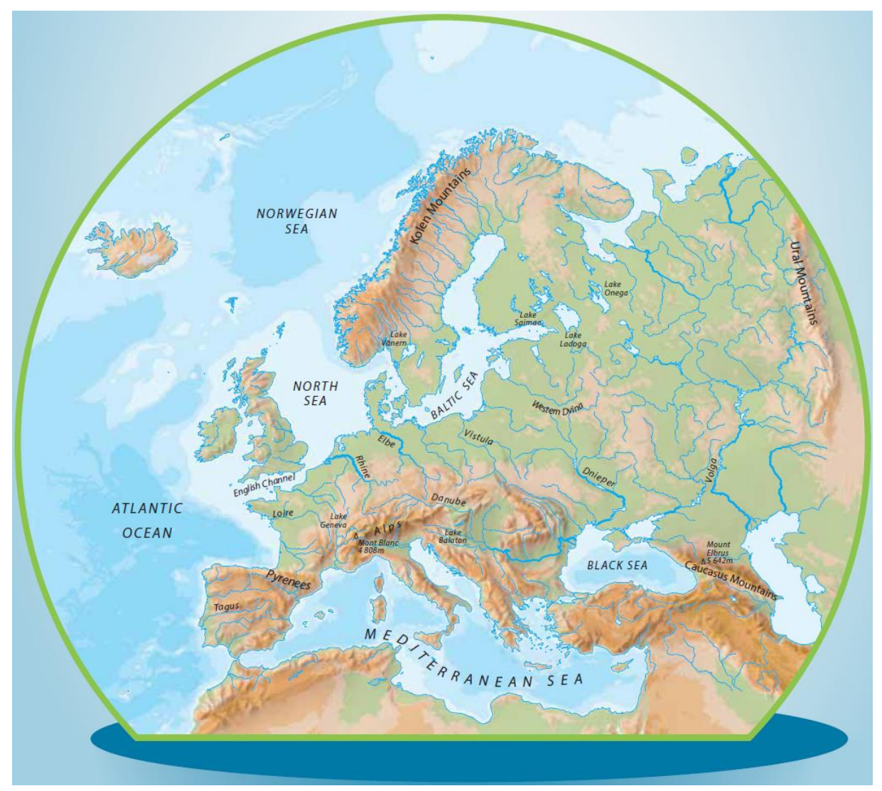
More than 700 million people live in Europe: 500 million of them in the European Union.

Europe is one of the world's seven continents. It stretches from the Arctic Ocean in the north to the Mediterranean Sea in the south, and from the Atlantic Ocean in the west to the Ural Mountains in the east.